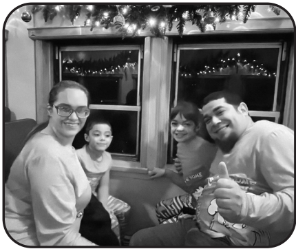
A cheerful family enjoying our 6th Annual North Pole Express.