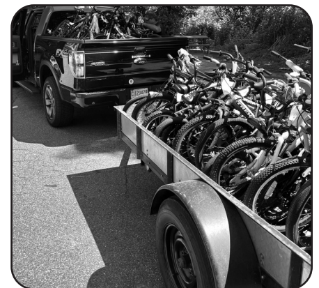
Another load of bikes headed to deserving kids

Why not check out Bikes For Kids? You can crank some nuts and bolts with the crew or take advantage of several other opportunities. We'd love to hear from you. All it takes is a phone call to 860-388-BIKE . Hope to hear from some of you. Our repair hours are Monday, Tuesday and Thursdays from 9:00-12:00.