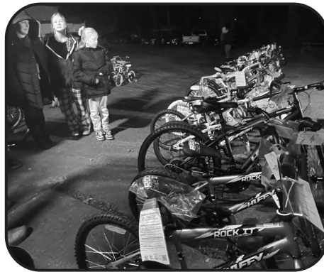
Children eagerly awaiting their new bikes!