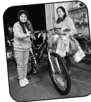
This young lady is excited to explore more of her town on her brand new bicycle.

BFK had an amazing evening at the Wheelhouse after a memorable train ride. We were filled to capacity with kids, parents, excitement, happiness, gratitude and our volunteers.