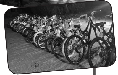
35 new bikes that were given to grateful children.