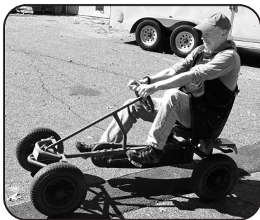
Testing a pedal car

His journey has taken him on numerous bicycle tours and centuries, where he has embraced challenges and explored breathtaking landscapes. His commitment to self-sufficiency shines through in his hands-on approach to bike maintenance—repairing not only his own bike but also helping fellow cyclists with their repairs. His willingness to share his knowledge and skills reflects his belief in the power of community and the joy of biking.