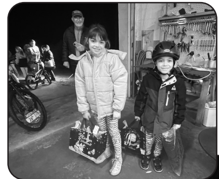
Happy siblings waiting for their new bikes.